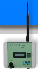
MDS-5 Com with GSM/GPRS-Modem