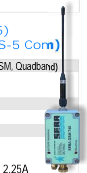
GSM/GPRS-Modem Type 740

The right is reserved to change or amend the foregoing technical specification without prior notice.