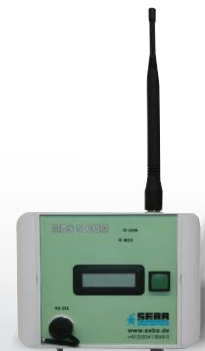
MDS-5 Com with GSM/GPRS-Modem