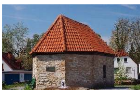
ground water - fountain house